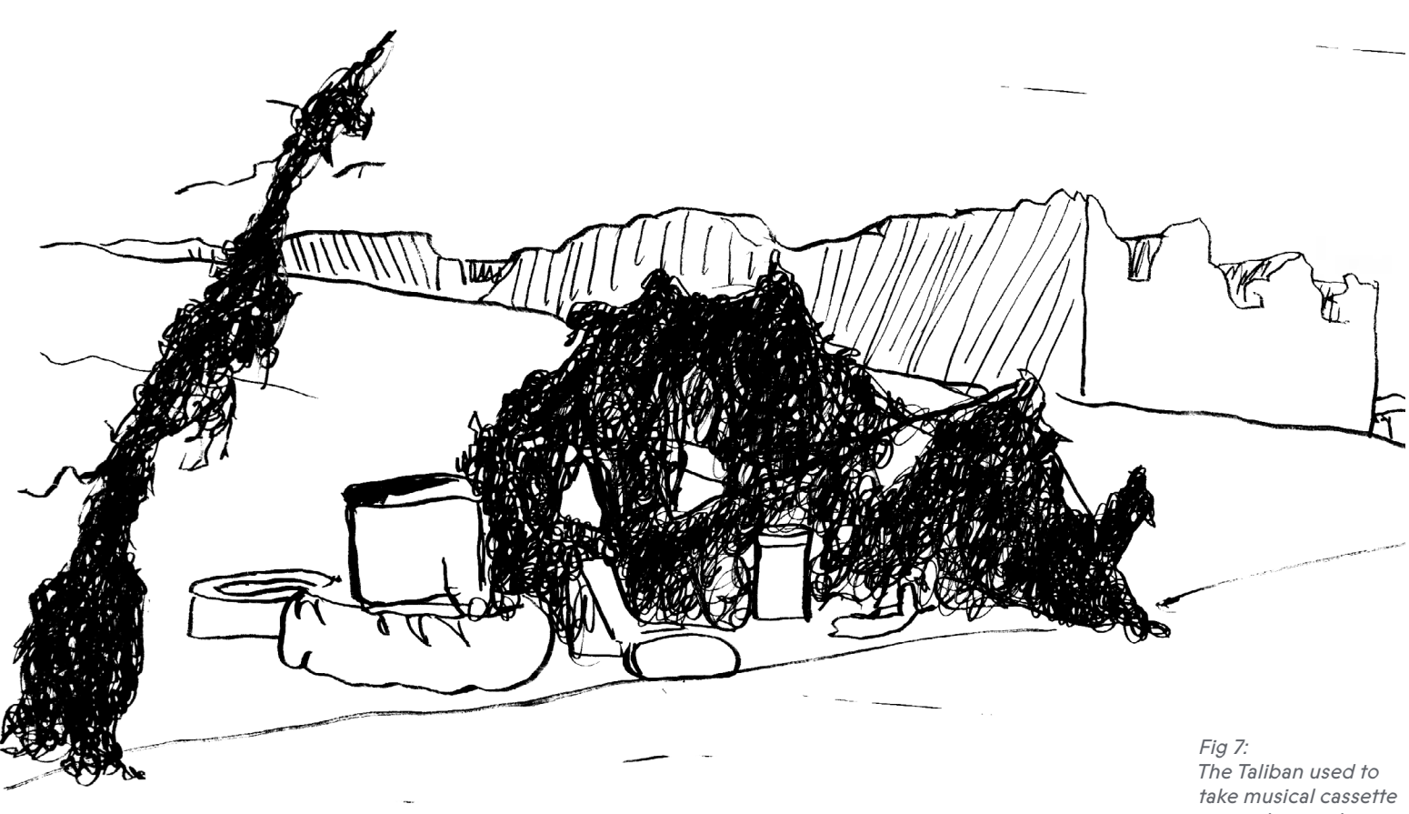
Fig 7: The Taliban used to take musical cassette tapes, destroy them and hung up proudly for all transgressors to see.

18. "Afghanistan National Institute of Music" – Letter from the Director. <u>https://</u> www.anim-music.org/ <u>letter-from-director.</u>