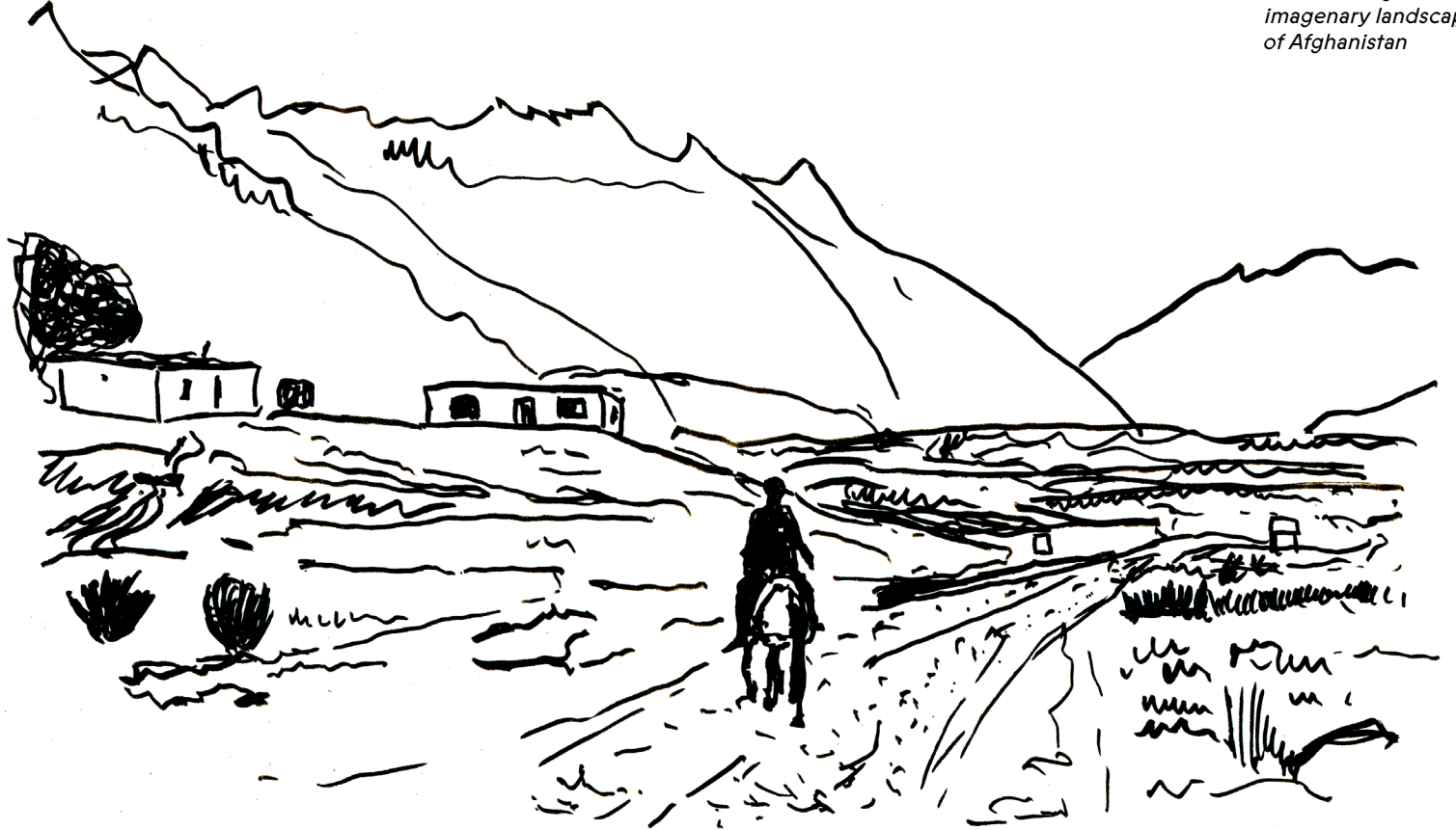
Fig. 4: A ride through an imagenary landscape of Afghanistan