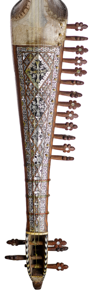
Fig. 1: The rubab, a short-necked lute from Afghanistan

In Afghanistan, traditional music training is strongly linked to the bond between a master, the so called "ustad", and his student, the "shagerd". Students take pride in tracing their ustad's lineage to old masters, often dating back over several generations. The apprenticeship begins with a string-tying ceremony, in which "the string tied around the pupil's wrist represents an unbreakable chain connecting teacher and disciple".<sup>1</sup> Students pay for their lessons with service to their teacher, for example by making tea and helping around the ustad's house. A strong relationship between teacher and student is formed through these actions.